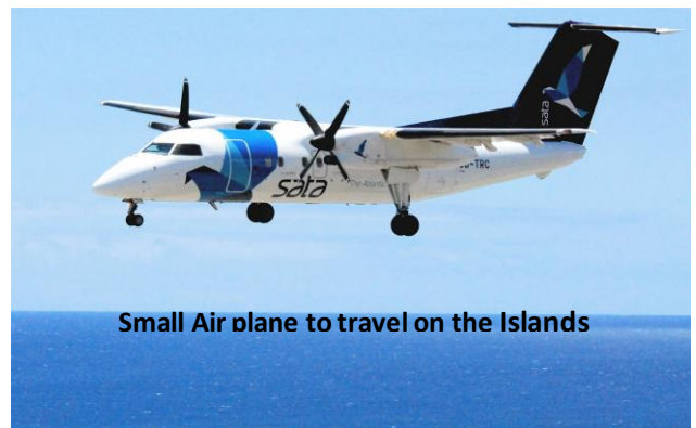
Small Air plane to travel on the Islands

Graciosa is the second smallest, divided in four towns in an area of 60 km 2 . There is not an establish gospel church (I spoke to a pastor from another Island who use to go monthly there, but due to flight cost he has not been there frequently). In winter time the ferry that cross the